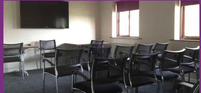
The Training Room has a capacity of up to 20 people in a theatre style setting

The facilities at Progress House provide a cost-effective corporate image and will allow you the time to concentrate on the needs of your company within a hassle free environment.