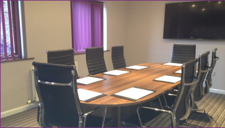
Board Room - Seats 8 to 10 people in a formal boardroom style.

Each room is equipped with a 60" screen display, flip chart and free wifi connectivity. Beverages are included within the hire cost of each room.